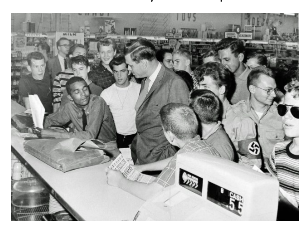
Figure 4. 1960 People's Drug sit-in protest, showing one of the harassers with a Nazi armband.

chose Arlington because of its proximity to the nation's capital. According to long-time Arlington resident Saundra Green, the American Nazi Party used to march down Lee Highway. Green also remembers one impactful run-in during her youth at the Calloway Church, which had been founded along Lee Highway in 1865 by formerly enslaved people. "Calloway Church played a major role in integrating the schools in Arlington... There was a meeting to integrate the schools, and... the Nazi party stormed into my church." In June of 1960, the American Nazis, led by Rockwell, harassed the Black students protesting segregation at the People's Drug Store lunch counter on Lee Highway (Figure 4). The American Nazi Party was headquartered in Arlington until 1983.