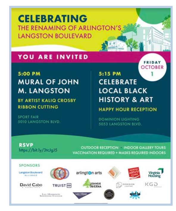
Figure 15. Announcement for the John M. Langston mural ribbon-cutting on October 1, 2021.

discrimination (Figure 17 and Figure 18). 115 These events served as a triumphant conclusion to the hard work and dedication of the volunteers, activists, and government staff involved in the Langston Boulevard Renaming.