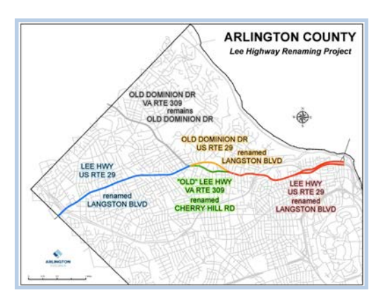
Figure 19. Map showing the newly renamed Langston Boulevard and Cherry Hill Road.