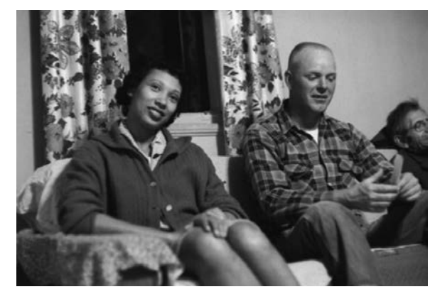
Figure 11. Mildred and Richard Loving in 1966, just before Loving v. Virginia.

allowed to leave Virginia to avoid imprisonment, but they soon decided to fight their conviction. Mildred Loving said they did not fight for a cause but for their love.<sup>86</sup>