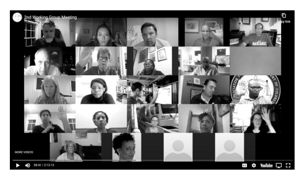
Figure 8. Screen shot of the 2nd Working Group meeting which took place over remotely over Zoom due to Covid-19 restrictions (Image courtesy of Langston Boulevard Alliance).

Lyon Village Citizens Association, among others.<sup>64</sup> The LHA provided a transparent forum and created rules of engagement to help the process flow more smoothly (Figure 8).