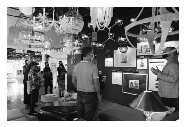
Figure 17. Pop-up gallery for the celebration of renaming Langston Boulevard (Image courtesy of Cindy Kane Photography).