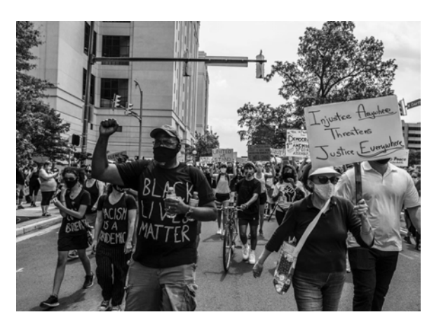
Figure 7. Protesters in Arlington, Va., taking part in the Arlington NAACP's "We Are Done Dying" Rally.