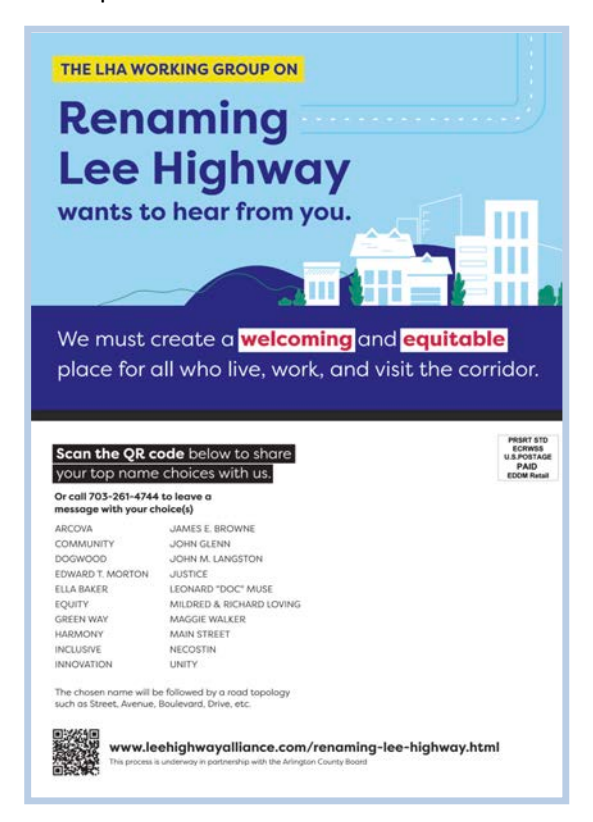
Figure 9. Postcard (showing front and back) that was sent to more than 8,000 homes in Arlington (Designed by Amber Haynes. Image courtesy of Langston Boulevard Alliance).

local community and businesses, directing them to the poll.<sup>74</sup>