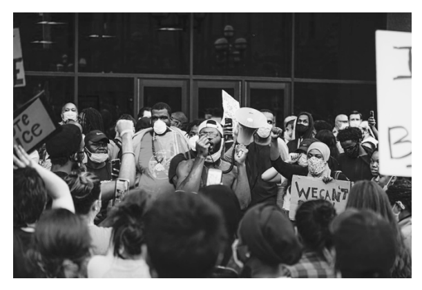
Figure 6. Protesters in the streets of Milwaukee on May 28, 2020, after the killing of George Floyd.

Floyd's death was one of several killings of unarmed Black citizens, often by White police officers, in the first part of 2020.<sup>36</sup> Demon-stators quickly took to the streets to protest entrenched issues of racial inequality and police brutality. Protests became so prevalent that by early June, curfews were enacted in 200 U.S. cities.<sup>37</sup> These protests became generally known as the Black Lives Matter movement (Figure 6).<sup>38</sup>