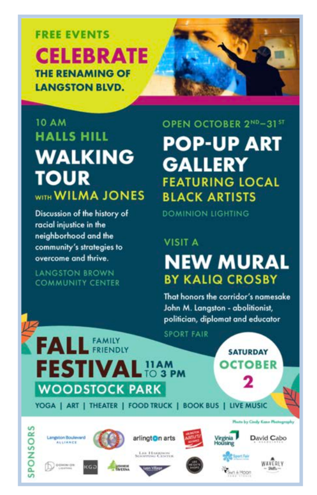
Figure 18. Announcement for the Langston Boulevard celebration on October 2, 2021 (Image courtesy of the Langston Boulevard Alliance).