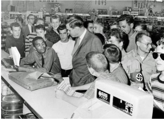
Figure 4. 1960 People’s Drug sit-in protest, showing one of the harassers with a Nazi armband.

counter on Lee Highway (Figure 4). 16 The American Nazi Party was headquartered in Arlington until 1983. 17