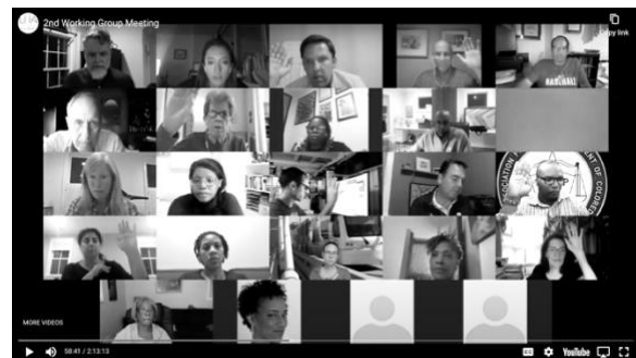
Figure 8. Screen shot of the 2nd Working Group meeting which took place over remotely over Zoom due to Covid-19 restrictions.

A valuable means of community engagement was the Working Group itself, which consisted of community activists and representatives of local civic associations. Represented were members of the local NAACP, Calloway Church, Cherrydale Citizens Association, Yorktown Civic Association, and the Lyon Village Citizens Association, among others. 64 The LHA provided a transparent forum and created rules of engagement to help the process flow more smoothly (Figure 8).