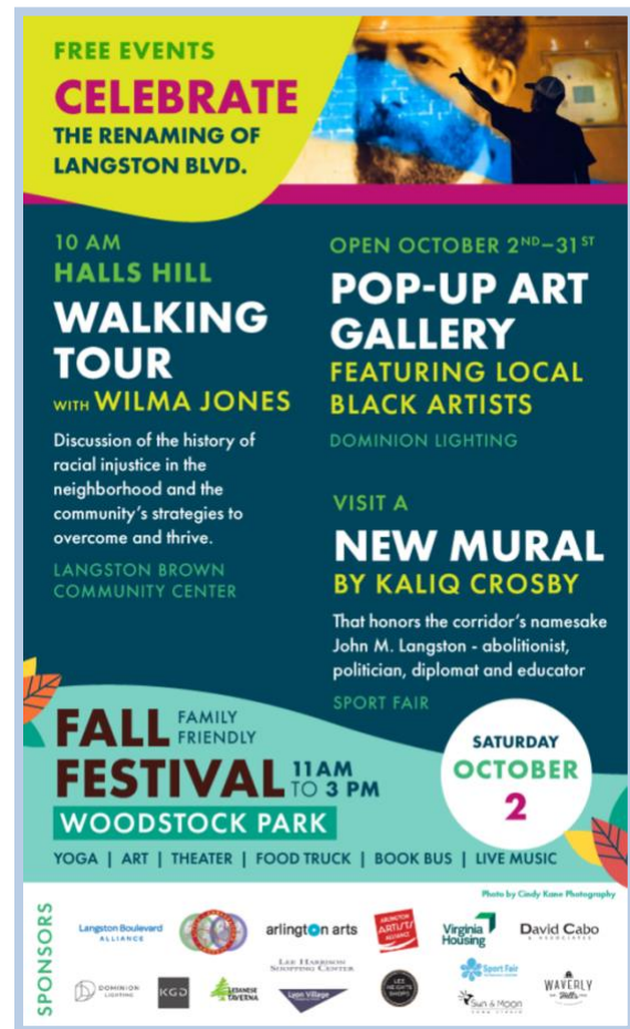
Figure 18. Announcement for the Langston Boulevard celebration on October 2, 2021 (Image courtesy of the Langston Boulevard Alliance).