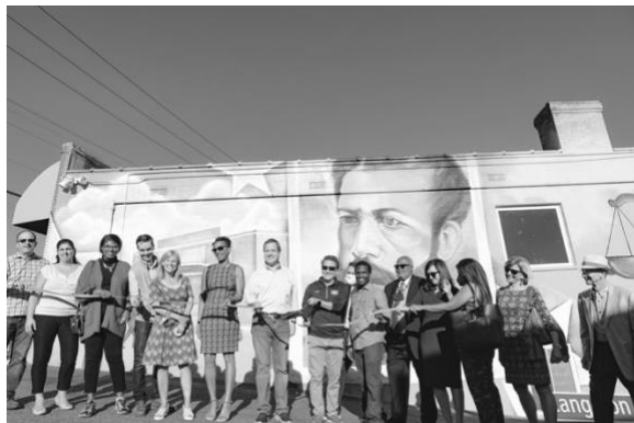
Figure 16. Ribbon cutting ceremony for the John M. Langston mural.