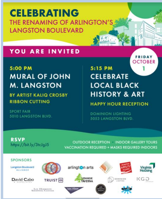
Figure 15. Announcement for the John M. Langston mural ribbon-cutting on October 1, 2021..