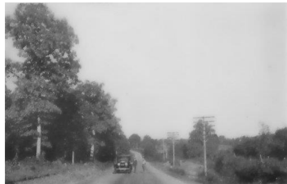
Figure 1. Lee Highway in the mid-1920s between Falls Church and the Fairfax courthouse.