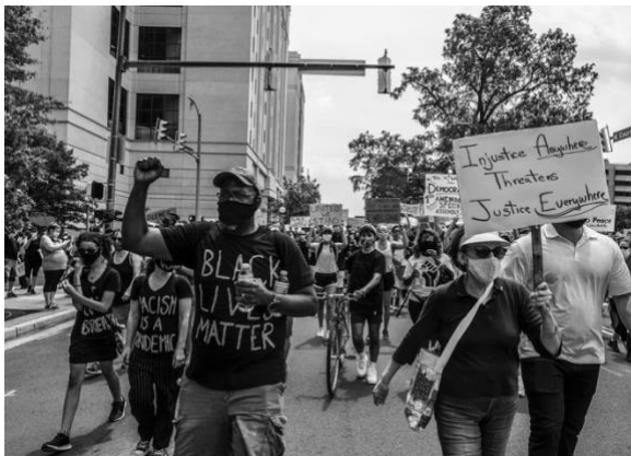
Figure 7. Protesters in Arlington, Va., taking part in the Arlington NAACP’s “We Are Done Dying” Rally.