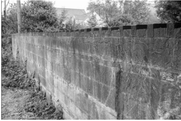
Figure 3. A masonry portion of the Hall's Hill segregation wall - date unknown (Image courtesy of Columbia University).

Black residents. The neighborhood was walled in on all of the sides...with this as a boundary between the Black neighborhoods and the White neighborhoods (Figure 3)." 8