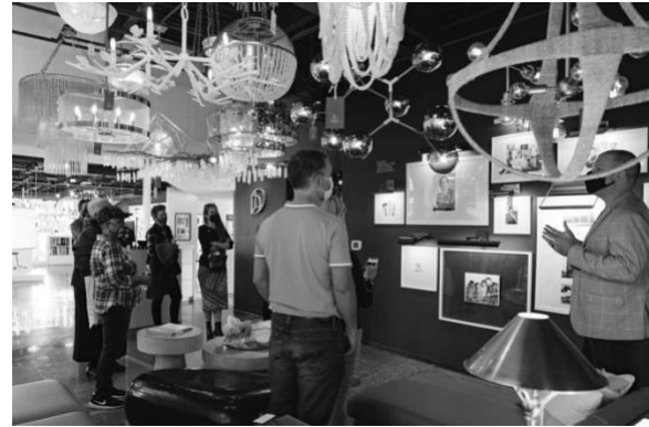
Figure 17. Pop-up gallery for the celebration of renaming Langston Boulevard (Image courtesy of Cindy Kane Photography).