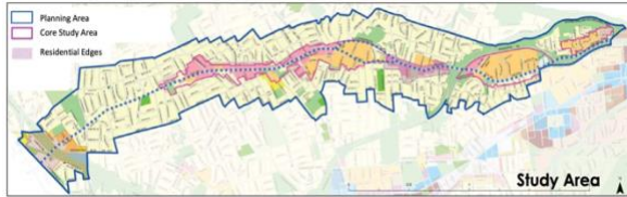
Figure 5. A map outlining the Plan Lee Highway planning area in Arlington, Va. The Core Study Area signifies the Lee Highway/Langston Boulevard route.