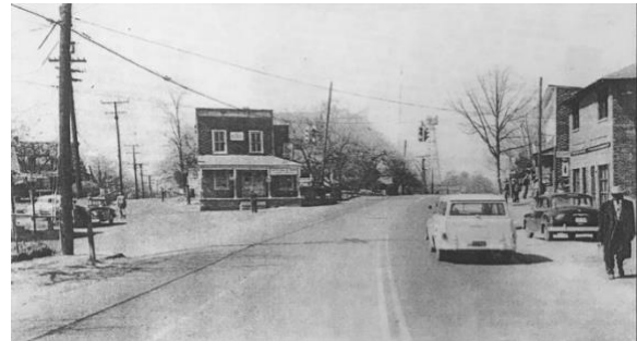
Figure 2. Hall’s Hill neighborhood along Lee Highway in the 1950s

started in 1918.... Lee Highway was a place of commerce and comfort in those blocks...But there were other areas that were not as safe, and we talk about it being Lee Highway.” 7