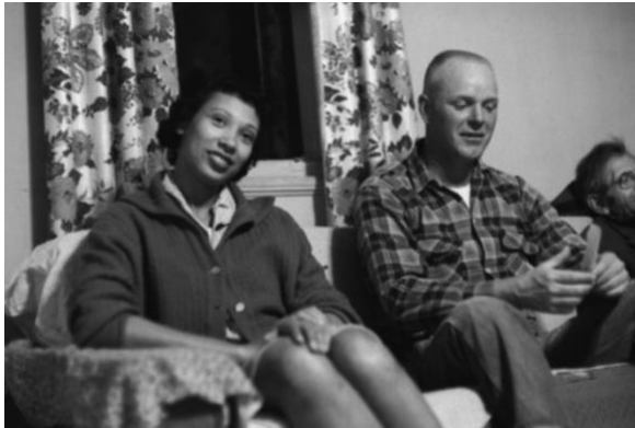
Figure 11. Mildred and Richard Loving in 1966, just before Loving v. Virginia.

marriage at the time (Figure 11). 84 Soon after returning to Virginia, they were arrested and prosecuted for the crime of marrying the “wrong kind of person.” 85 The Lovings were allowed to leave Virginia to avoid imprisonment, but they soon decided to fight their conviction. Mildred Loving said they did not fight for a cause but for their love. 86