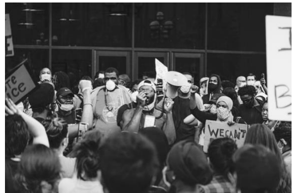
Figure 6. Protesters in the streets of Milwaukee on May 28, 2020, after the killing of George Floyd.

Floyd’s death was one of several killings of unarmed Black citizens, often by White police officers, in the first part of 2020. 36 Demonstrators quickly took to the streets to protest entrenched issues of racial inequality and police brutality. Protests became so prevalent that by early June, curfews were enacted in 200 U.S. cities. 37 These protests became generally known as the Black Lives Matter movement (Figure 6). 38