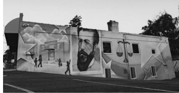
Figure 14. The John M. Langston mural in the Hall’s Hill neighborhood of Arlington.