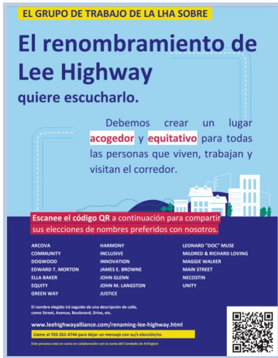
Figure 10. Flyer for the renaming poll shown in Spanish.