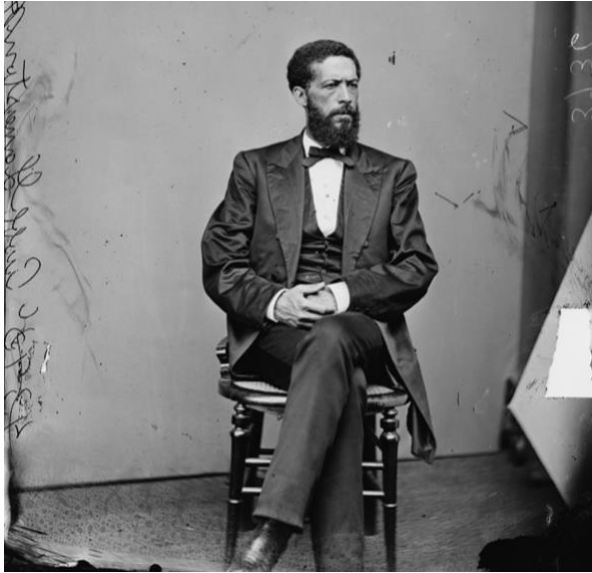
Figure 12. John M. Langston, shown when he was a professor at Howard University around 1860-1875.